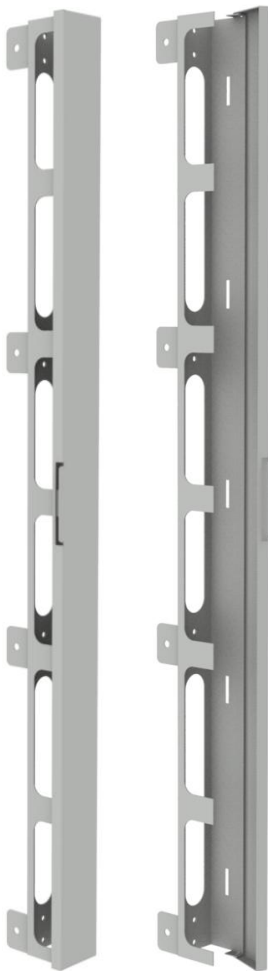
visualization of the vertical cable organizer V-CO series