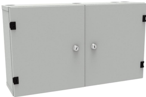
visualization of the closed RDD box without cable spare section