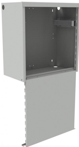
visualization of the open anti-burglary cabinet SA-ZNK series