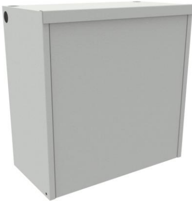
visualization of the closed anti-burglary cabinet SA-ZNK series