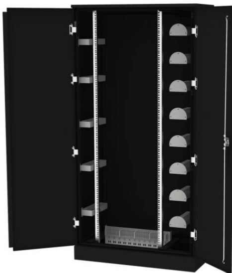
visualization of the open free-standing optical distribution frame 19" SDR series