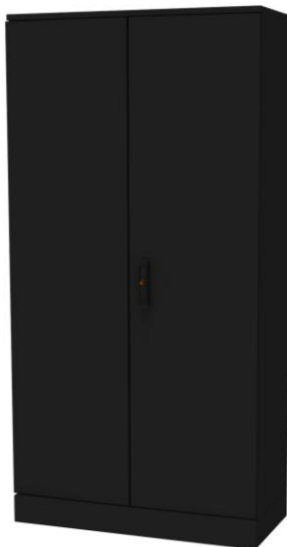
visualization of the closed free-standing optical distribution frame 19" SDR series