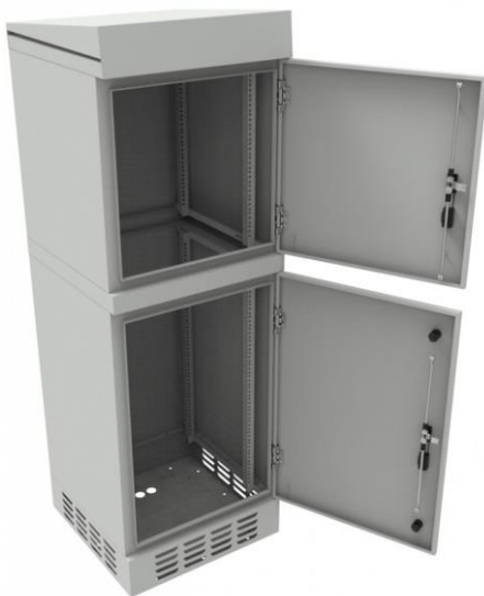
visualization of the open free-standing 19" modular rack cabinet SZWM series