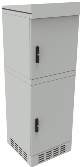
visualization of the closed free-standing 19" modular rack cabinet SZWM series