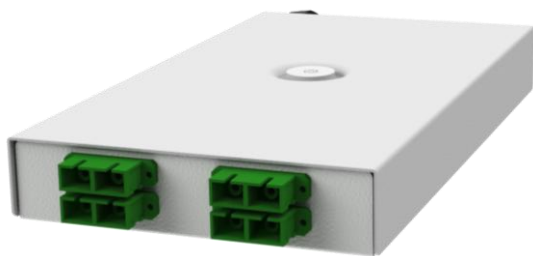
visualization of the closed FO termination box PK-V2 series