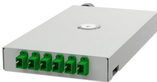
visualization of the closed FO termination box PK-V2 series