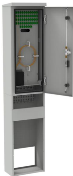
visualization of the optical outdoor cabinet SZS-SZ series