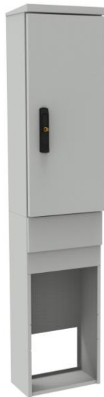
visualization of the optical outdoor cabinet SZS-SZ series