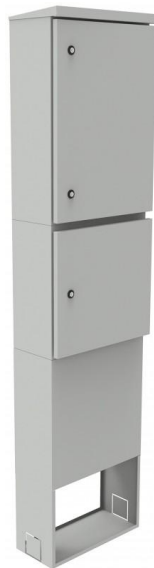
visualization of the closed optical outdoor cabinet SZS-M series