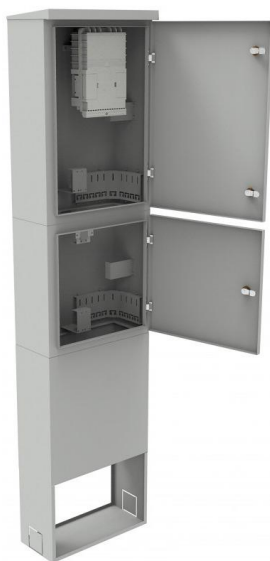
visualization of the open optical outdoor cabinet SZS-M series