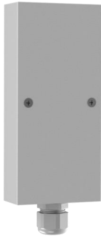
visualization of the closed RT divider