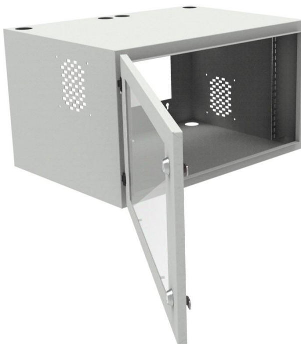
visualization of the open TPR 19" rack cabinet