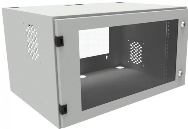
visualization of the closed TPR 19" rack cabinet