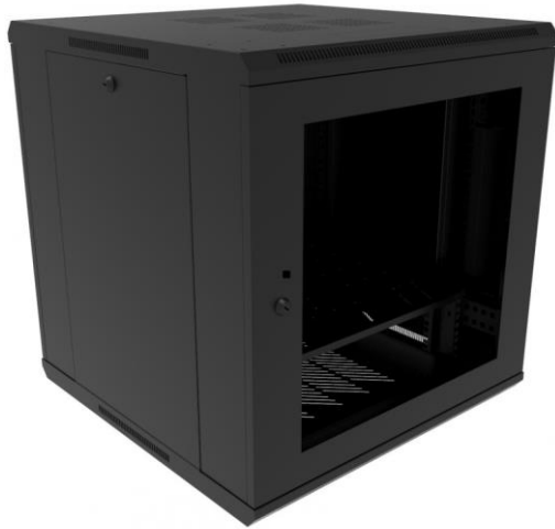
visualization of the closed free-standing 19" rack cabinet SWW series