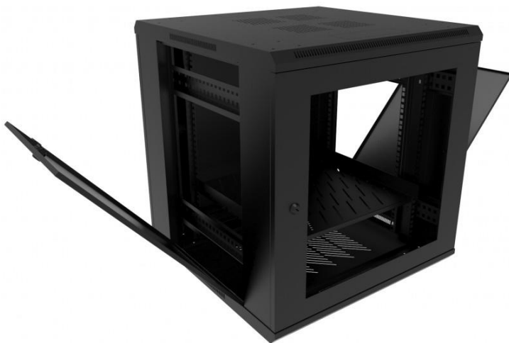
visualization of the open free-standing 19" rack cabinet SWW series