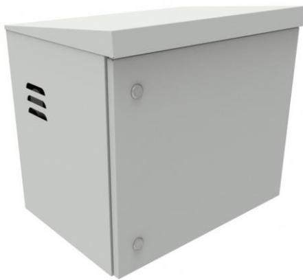
visualization of the closed 19" mast rack cabinet SZM series