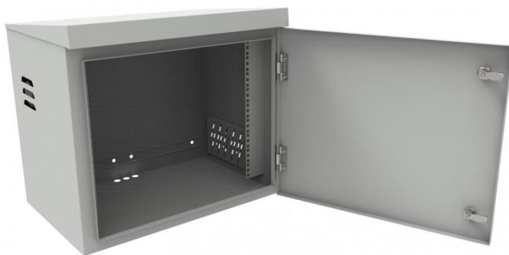
visualization of the open 19" mast rack cabinet SZM series