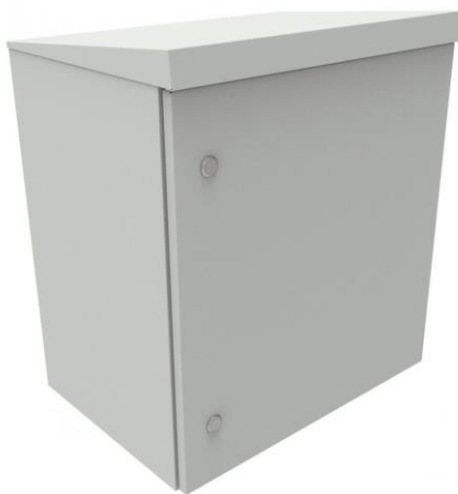
visualization of the closed hermetic mast cabinet with mounting plate SZMH series