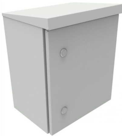
visualization of the closed hermetic 10" mast rack cabinet SZMH series