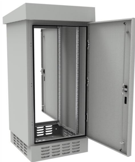
visualization of the open free-standing double-walled 19" rack cabinet SZWD series