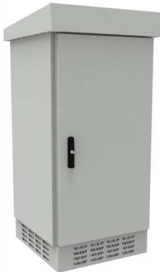
visualization of the closed free-standing double-walled 19" rack cabinet SZWD series