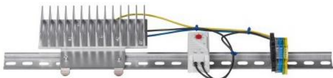
visualization of the heating kit with thermostat