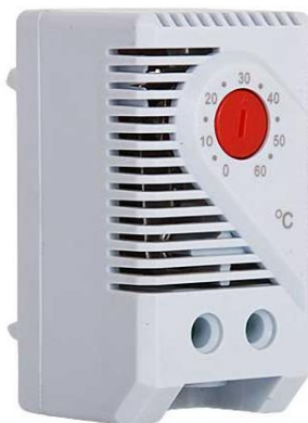
visualization of the thermostat KTO-011 for heating kit

The manufacturer reserves the right to make modifications and improvements to the product. Therefore, the products shown in the illustrations and photographs may differ slightly from the actual state.