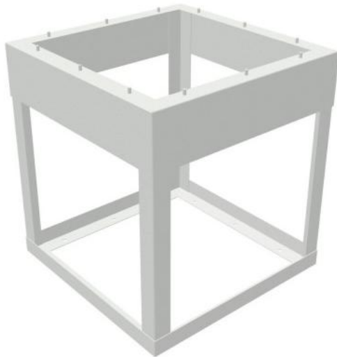
visualization of the ground-mounted plinth