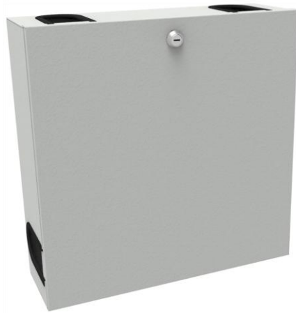
visualization of the closed ZK cable storage box