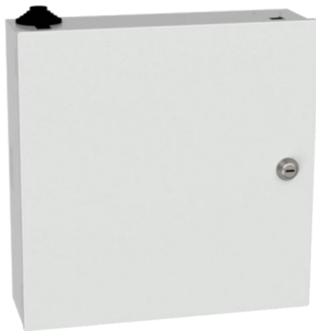
visualization of the closed PDW series wall box